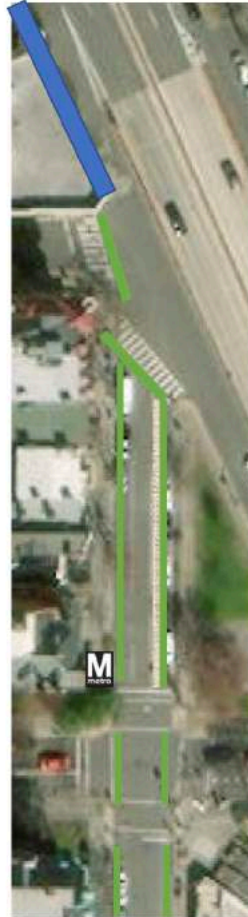
Q Street to Hillyer Place